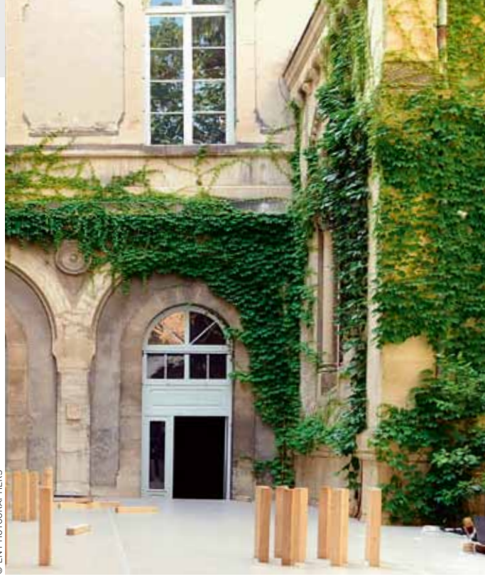
Virgin garden at the Saint-Joseph Gymnasium.

Co-production: SACD and the Avignon Festival